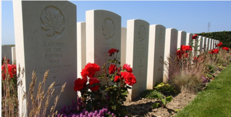
^ The Dieppe Canadian Cemetery

Today's visit to Dieppe offers a sobering look at one of the most difficult chapters in Canadian military history, as well as the broader story of the Allied struggle during World War II. The lessons learned from the Dieppe Raid were critical in shaping the success of later operations like D-Day, and visiting these historic sites provides a deeper understanding of the courage and sacrifices of the soldiers involved.