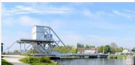
^ Pegasus Bridge

This day sets the tone for an unforgettable journey through Normandy, immersing you in the region's incredible history and paying tribute to the men and women who shaped its legacy during one of the most pivotal moments in world history.